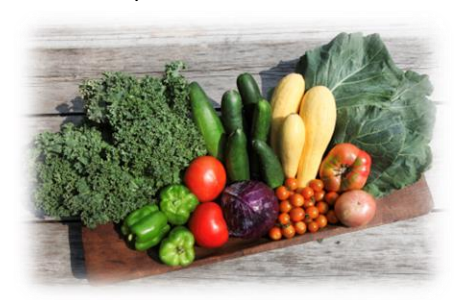
Example of a Regular Share from July

A typical, regular size Farm Share will have a nice variety and quantity of 6-8 different types of produce. Early in the season, the quantity and variety will be less, but offset by higher value produce likes strawberries which are one of our customer's most favorite. They are also one of the most costly crops we grow. As the season progresses, you will have a much wider selection of produce to customize your weekly share. (see the chart below)